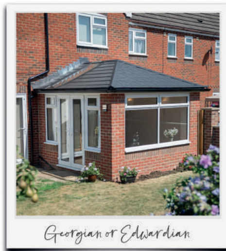
Georgian or Edwardian

The Prefix WARMroof is designed to accommodate all existing conservatory roof styles as these are more complex than typical traditional extension roofs. Therefore, to date, we haven't had a roof design that is beyond the scope of the roof's capabilities. No matter what shape or style of conservatory you have, there is a WARMroof for you. Below are some examples of WARMroof installations on various styles of conservatory or home extension but we can do many more styles and configurations - please ask us for more information.