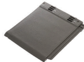
Dark Brown ▲