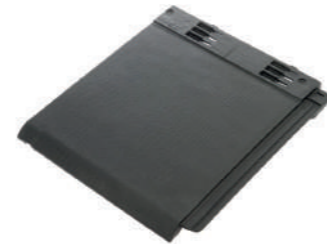
Slate Grey ▲