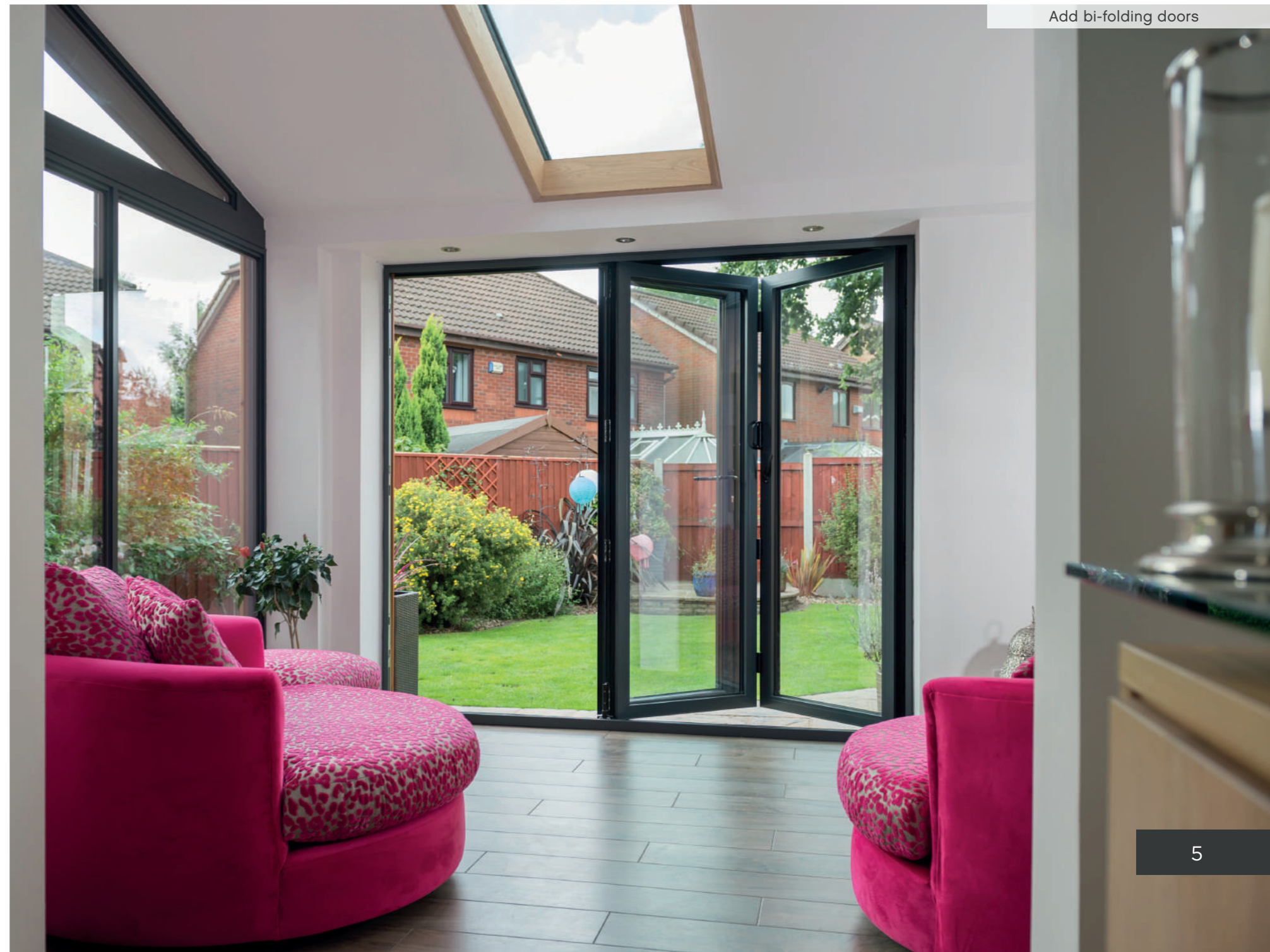
Add bi-folding doors