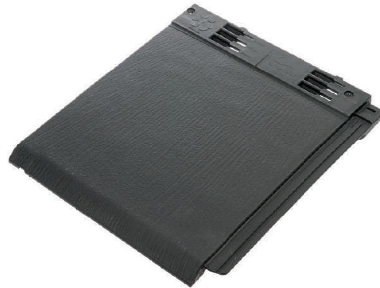
Anthracite Black ▲

Request to see samples swatches of our tiles & colours. ►