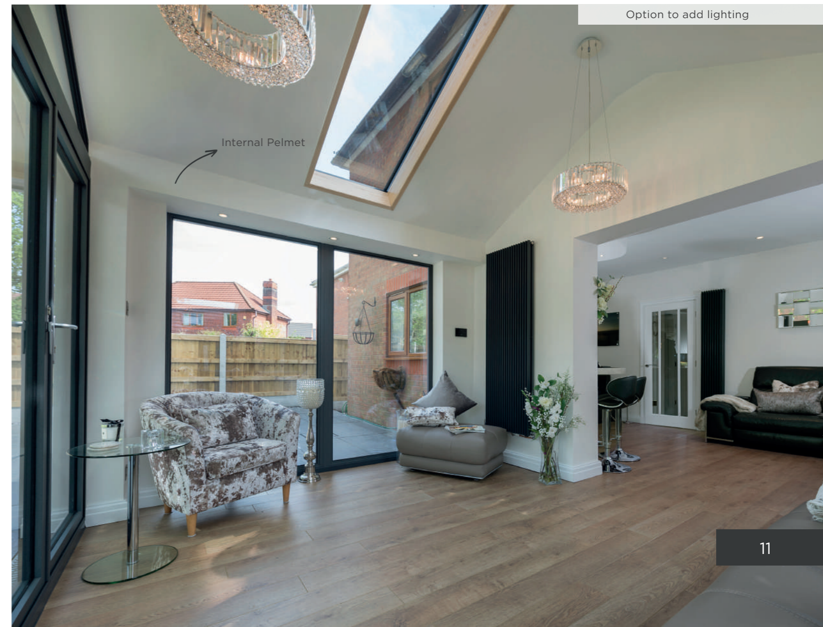
Option to add lighting